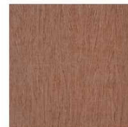
NEW LAND CHERRY